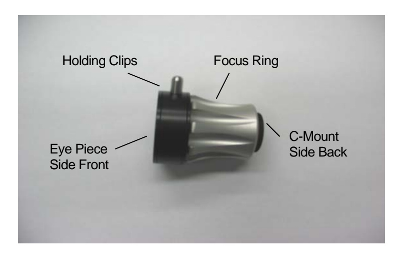
AMD-2015 ENT Scope - Components Diagram

The AMD-2450 Coupler is required to assemble the ENT Scope with the AMD-400 Camera and Illumination Source. The AMD-2450 consists of a single unit. On the front end is the Standard Eye piece adapter. On the back end is the C-Mount screw. The AMD-2450 is illustrated in the following diagram: