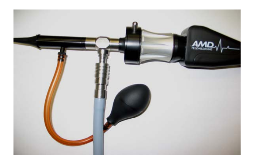
Step 1 - Assemble of the AMD-2450 Coupler with the AMD-400 camera cable Screw coupler onto AMD-400 camera cable.